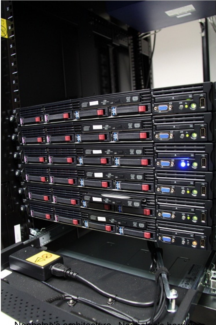
Nephelae's architecture - Nephelae's hardware Nephelae's Hardware Specifications